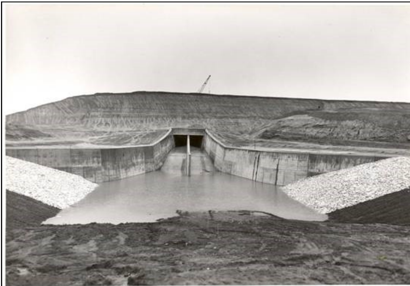
Figure 1. Image of the Lake O' the Pines Ferrel Bridge Dam construction circa 1950s.

Water quality management plans were developed in order to address these phosphorus loadings by looking at different sources of point source and non-point source pollution that were affecting the water quality. Point source pollution is a pollutant that is discrete, or easily identifiable, such as wastewater facilities outflows. Non-point source pollution is diffuse, or harder to identify, such as pollutants carried from rainwater on an agricultural field or forest clearcut to a stream.